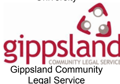
Gippsland Community Legal Service