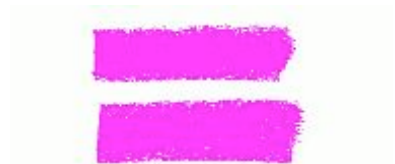
Gay & Lesbian Rights Lobby NSW Gay & Lesbian Rights Lobby