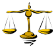
Cairns Community Legal Centre Inc