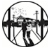
Annie North Inc